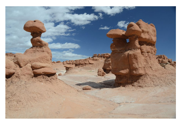
Figure 8. Landforms shaped by wind in the desert