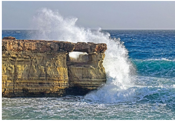
Figure 7. Cliff with sea waves

1. Show the two pictures of different landforms (Figures 7 and 8) and ask: