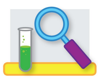
Tester Takes the lead in carrying out investigations and testing designs.

Makes sure group members work together and complete work on time.