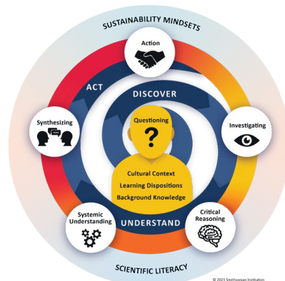
Figure 2: Global Goals Action Progression.

Finally, young people apply both their existing knowledge and their newly gathered information. First, they consider personal changes they could make to help make their communities more